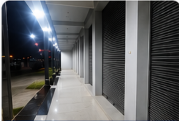
SHOP FRONT WALKWAY