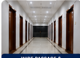
WIDE PASSAGE & SPACIOUS COMMON AREA