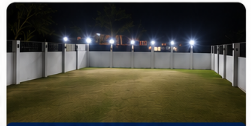
OPEN AIR BACKSIDE GROUND