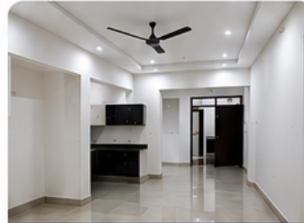
2 BHK APARTMENT INTERIOR